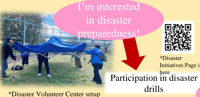
Initiatives Page is

Volunteering at children's cafes & learning support classes